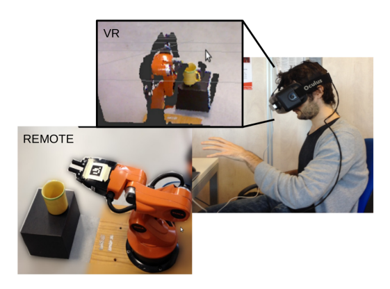
Figure 2: Proposed interaction. The user's setup (right), the 3D view (top) and the robot in the remote scene (bottom left).

Figure 2 shows the user setup together with the virtual and remote scenes.