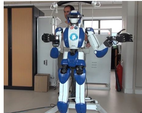
Fig. 3: Real robot tracking

In the subsequent offline motion tracking phase we use the motion tracking formulation (13) and update E_1 , E_2 , and (13) whenever the time t reaches the next event timing t_j along the sequence.