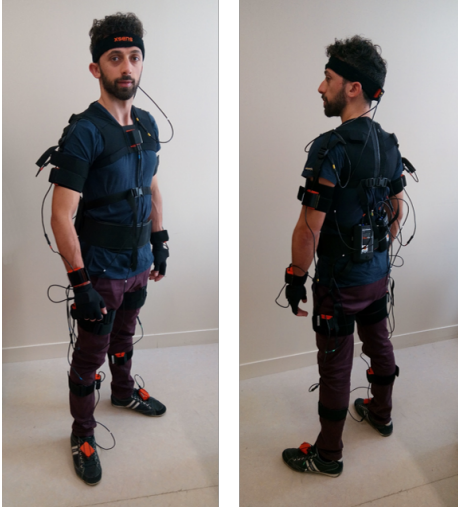
Fig. 1: Front and rear view of the human subject wearing the Xsens system

a real robot, hence our contribution with respect to the state-of-the-art.