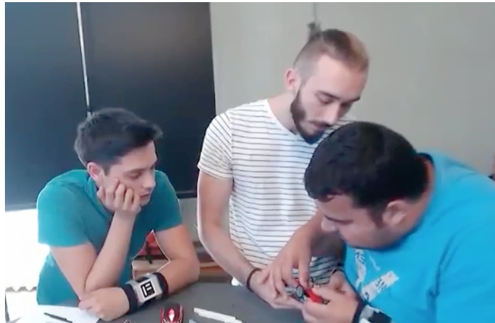
Figure 2. students from left to right have a coding of 122 meaning that leftmost student is looking, and the other two are working together.

The per time-window coding has been used to compute three aggregate scores for the whole session based on the semantics of the encoding. Physical engagement is measured by the percentage of code 2 over the total. Synchronisation is measured by the combined percentage of 222 and 111 codes. These are the two situations in which all students are active or all semi-active. The 111 code corresponds to the specific case in which a facilitator or teacher enters the scene and the students are looking (semi-active) at him/her. Finally, individual accountability has been measured by the total number of situations in which at least one student is looking at another student actively working: that is all the combinations of a 2 with two 1 code, and two 2 codes with one 1 code (e.g. 211, 221). These are the situations in which at least one student is paying attention to the physical actions of another student. Table 1 presents the summary of the CPS evaluation results based on this coding for the 12 sessions. Each score is presented as a percentage of the whole time.